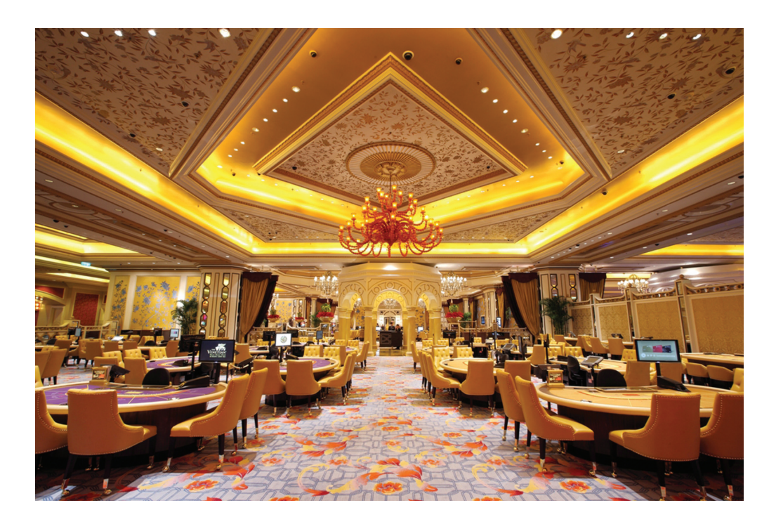
Figure 1-1 High-limit area. Casino at the Venetian Resort. Macao.

This challenging and exciting profession has had a huge impact on the interior design and construction industry in the United States and throughout the world. Interior Design magazine reports on the industry's 100 largest design firms. In the January 2014 issue, it reported that approximately $3 billion in design fees were generated by these firms in commercial projects alone in 2013 ("The Top 100 Giants" 2014, 84). This not only represents an increase from previous years, but it reflects only a portion of the total commercial interior design industry because it only relates to the top 100 firms reported by the Interior Design giants.